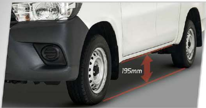
GROUND CLEARANCE - Keep Operations Going & Deliver No Matter What the Road Condition.