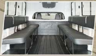
Foldable Seats for Flexibility & Convenience. Non-Slip Floors for Passenger Safety.