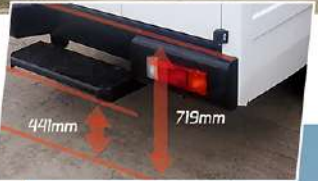
Height-Appropriate Steps to Ride & Load with Ease.