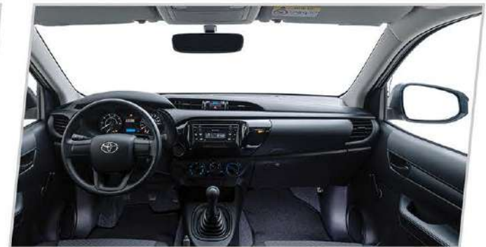
CABIN COMFORTABILITY - Comfort for Long Drives with Airconditioning, Spacious Legroom, a USB Charger, & 2DIN Audio.