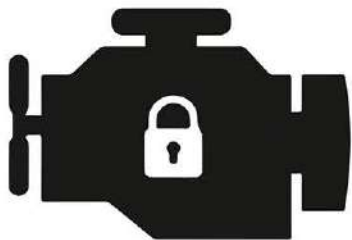
IMMOBILIZER - Precaution & Protection for Owners.