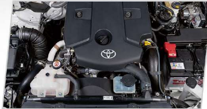
More Powerful and Fuel Efficient 2.4L Direct Injection Diesel Engine with 400Nm (Hilux 4X4 J) and 343 Nm (4X2 Hilux J, Hilux Cab & Chassis).