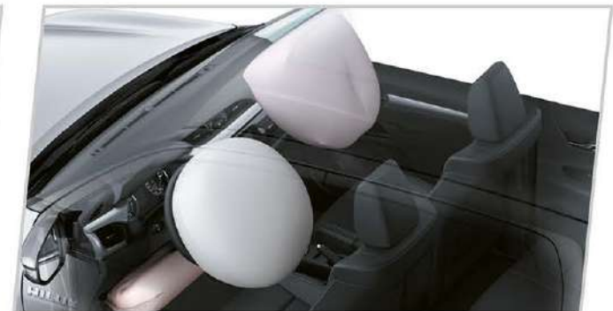
AIRBAGS - Safety & Assurance for Driver & Passenger.