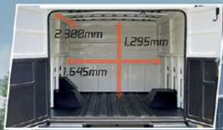
Spacious Cargo Area for Up to 24 Boxes**