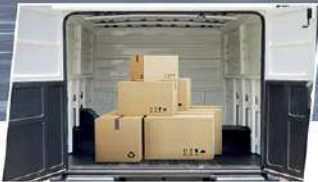
Windowless Cargo Box for Security & Safety.