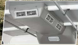
Assist Grips & Aircon for Rear Passengers