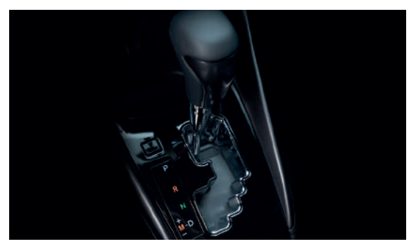
Continuous Variable Transmission (CVT) -Enjoy seamless gear shifts with Continuous Variable Transmission.