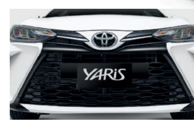
New Front Grille Design - The Yaris' sporty mesh type, new front grille will definitely get you all the attention on the road.