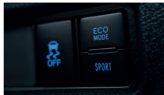
Eco and Sport Drive Mode* - The Toyota Yaris comes with Eco and Sport Mode for fuel efficiency and performance acceleration. Perfect for whatever driving mood you're in.