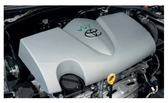
1.5L Engine* - The 1.5 Dual VVT-i Engine provides fuel efficiency at all engine speeds.