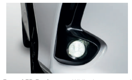
Front LED Foglamps - While the revamped foglamps look better than ever, it also improves visibility. Especially in situations where mist, fog, and dust are present on the road.