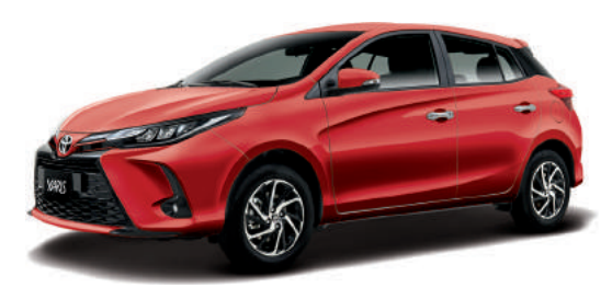
RED MICA METALLIC