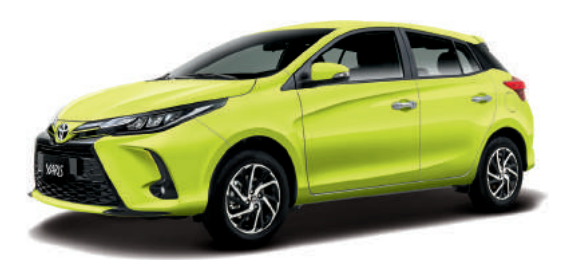
CITRUS MICA METALLIC