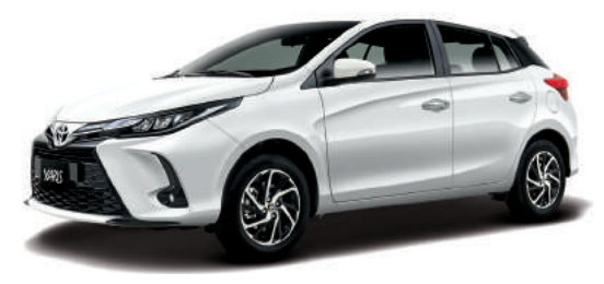
SUPER WHITE II