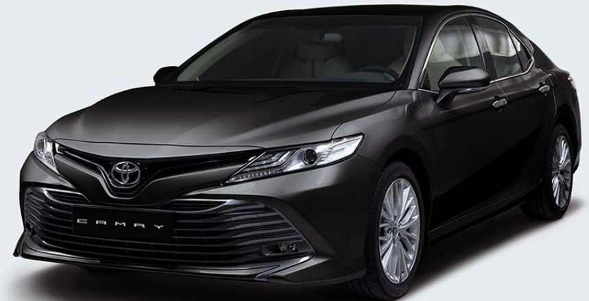
ATTITUDE BLACK MICA