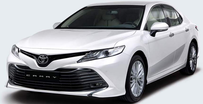
PLATINUM WHITE PEARL MICA