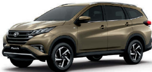
BRONZE MICA METALLIC