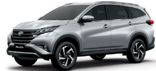
SILVER MICA METALLIC