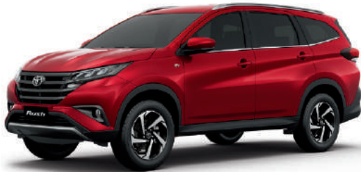
DARK RED MICA METALLIC